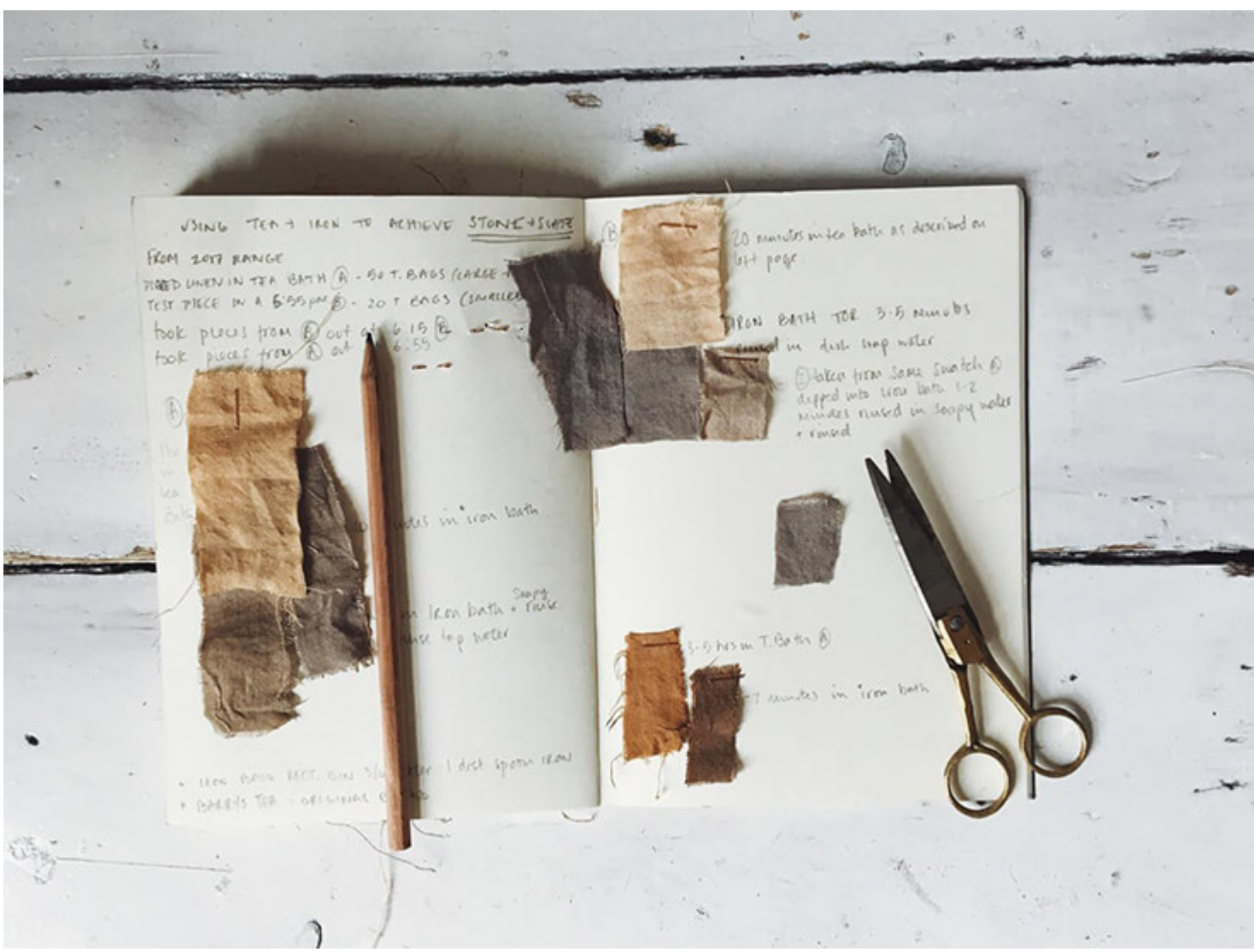
Linen samples using Tea & Coffee

As many of us are in lockdown whether voluntarily or mandatory now is as good a time as any to distract ourselves with some simple projects. Considering that many of us can't leave our homes & some of us may be feeling the economic pinch, this project is based on using food or food waste you may have without having to purchase anything. Here's an easy natural dye project you can do at home with a few simple ingredients.