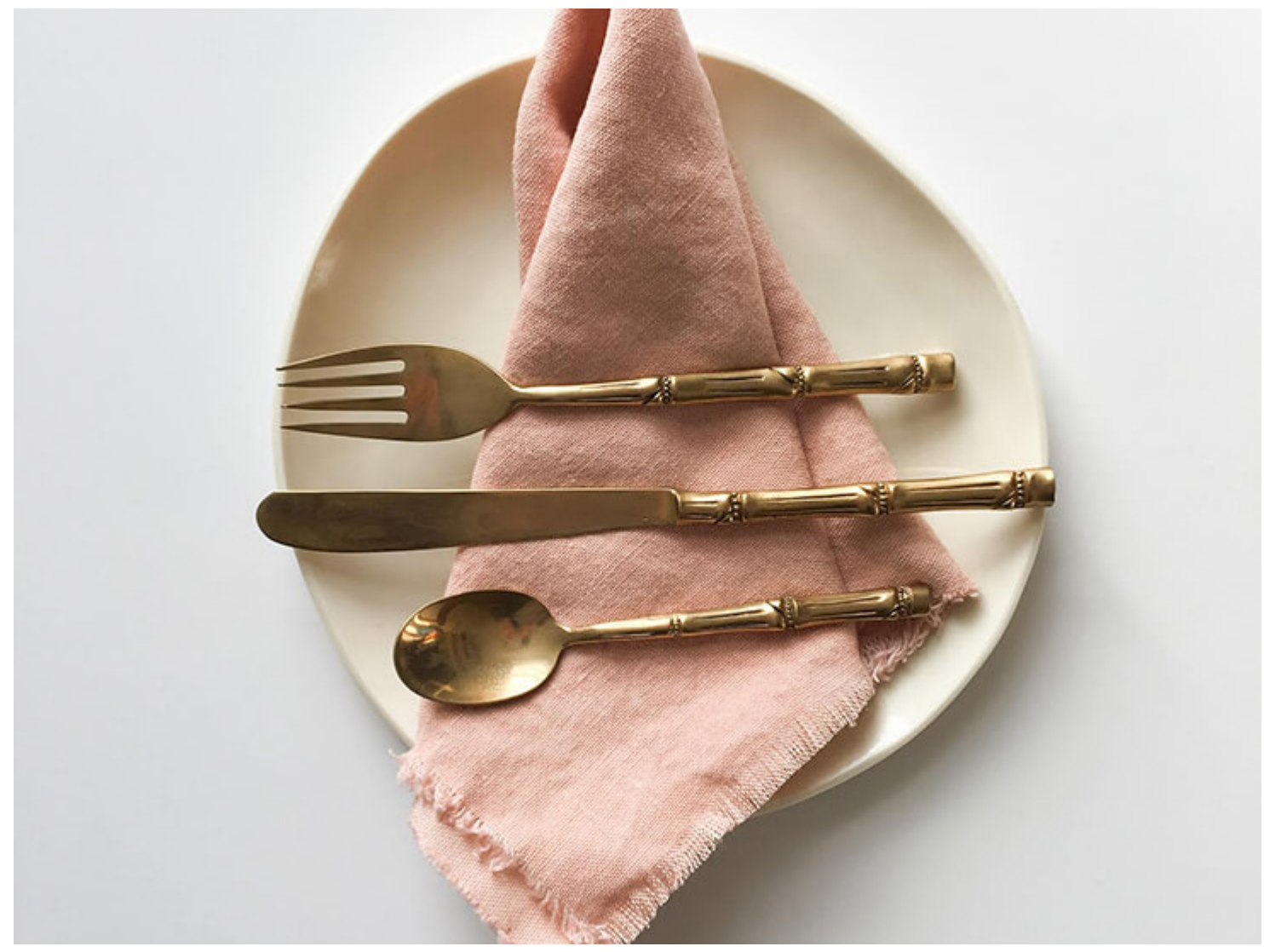
Linen dyed with avocado stones

6. You can hand or machine wash as normal.